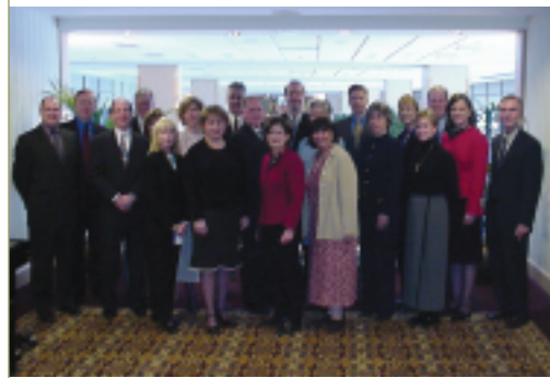
Patient Friendly Billing Project Technology Task Force

To date, the Patient Friendly Billing project has researched relevant billing issues and reported the findings and recommendations to hospitals, health systems, and medical group practices. The visibility of the project has skyrocketed, with Patient Friendly Billing becoming a sought-out topic at key industry events. Awareness about Patient Friendly Billing has also climbed because of hospitals’ and medical group practices’ own initiatives to implement the Patient Friendly Billing recommendations. Most recently, the project formed a Technology Task Force to ensure that technology vendors were involved in supporting improvements to patient billing.