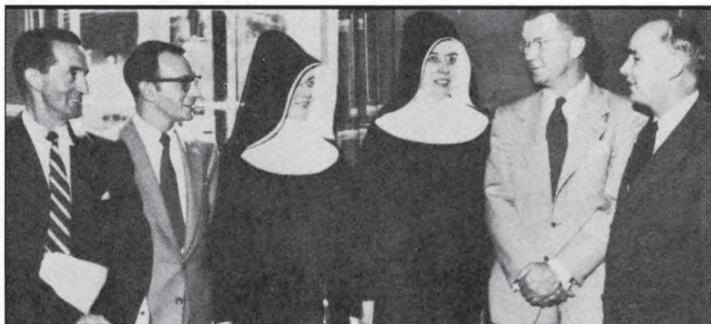
New Mexico Chapter members at La Fonda Hotel, Santa Fe, New Mexico. October 4, 1954.