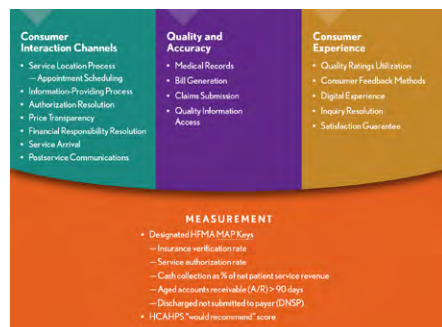
The Consumerism Maturity Model

Discover your organization's consumerism maturity level and Consumerism Maturity Index Score (CMIS) by taking these four steps.