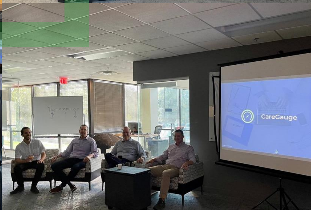
EvidenceCare Culture Video