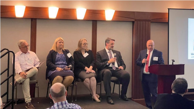
CFO Panel at the NNE HFMA Healthcare Reimbursement Conference on September 26, 2023 at the Grappone Conference Center in Concord, NH